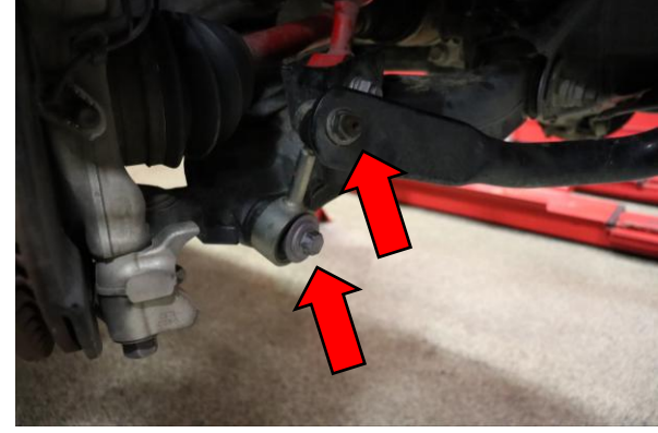
tep 3 Step