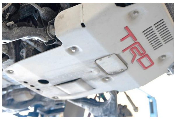
Step 32. IF equipped with a skid plate reinstall

Repeat steps 1-31 for other side. Double check to make sure everything is properly positioned and tightened, Step 33. then, road test the vehicle and retighten if necessary.