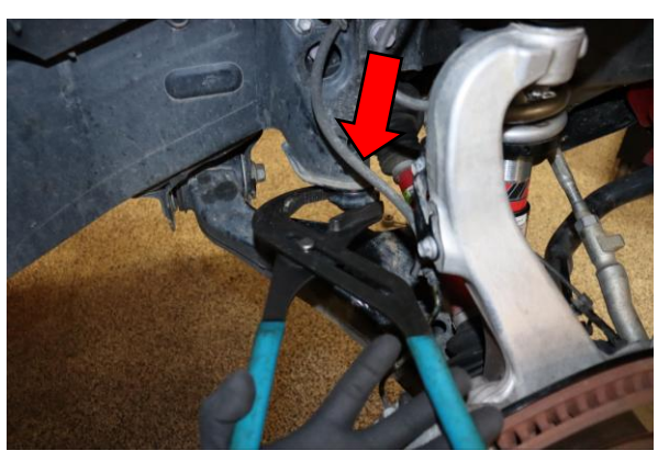
Step 30. Remove the Front bump stop on each side.

Step 29. Re-install the 10mm bolt holding the wheel speed sensor to the upper control arm