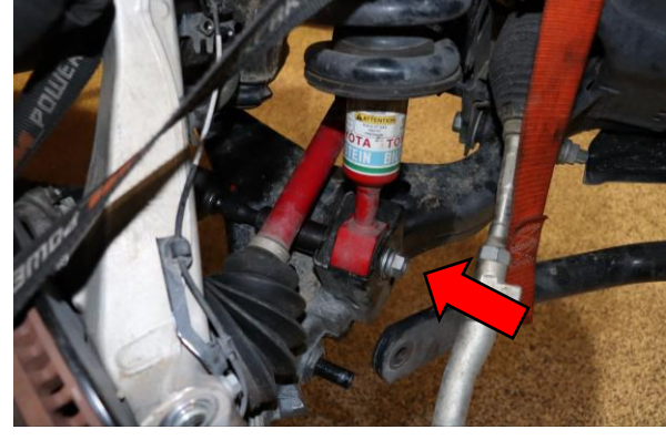
tep 12c Step 12

Step 12c. Apply pressure on the upper control arm and remove the nut. Then release the pressure on the pry bar while holding the knuckle so it doesn't fall.